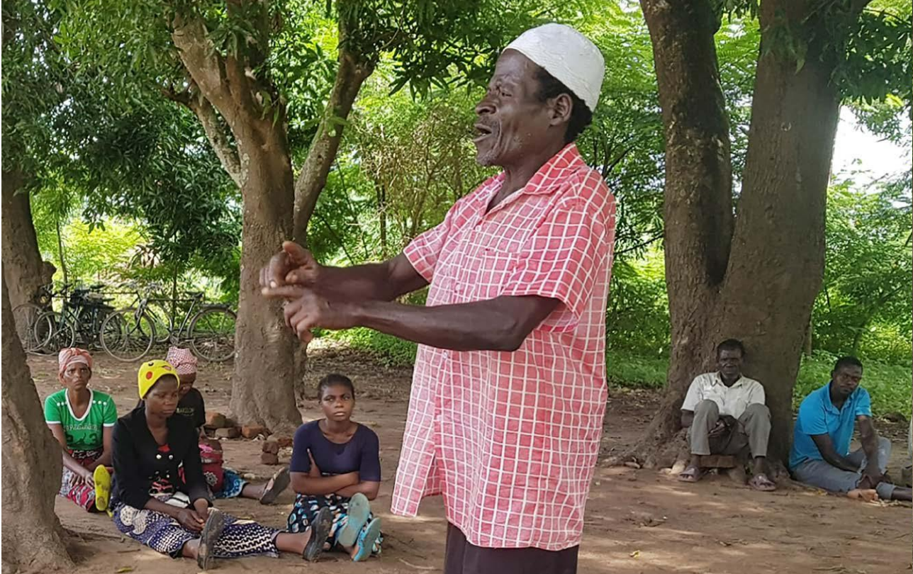
Climate change adaptation community discussions.