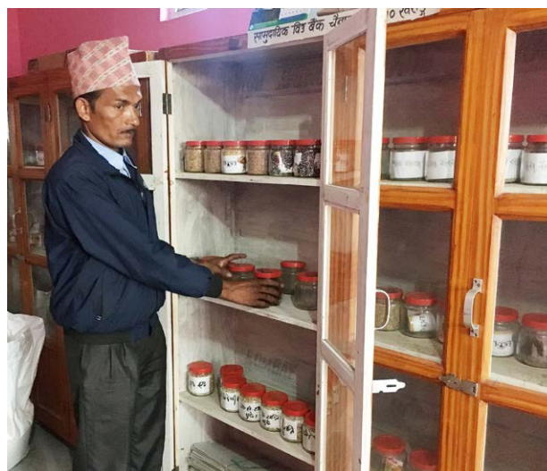
Community seed banks.

Many Village Land Rights Forum (VLR) members have been empowered through training to become frontline leaders and represent their communities at national level. The VLR now exhibits confidence and skills, and the ability to proffer solutions to land ownership challenges in their communities. The VLR in various districts has established Legal Camps that they use to argue their cases at various levels. The VLR has also engaged government departments and argued the case for the issuance of land ownership certificates to former land tenants who have occupied lands for over a decade. With the support of the land rights movement, a total of 143,546 tenancy rights claims were submitted in 2018 and of these 73,917 of these were successfully settled; also, 439 couples had received land ownership certificates by 2018. The joint ownership of land at household level has also contributed to guaranteeing women's access to land and enhanced their status in the family. Women have access to land rights, which ultimately leads to the economic empowerment of women.