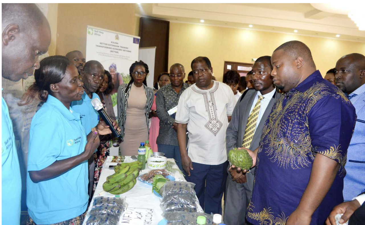
ActionAid Malawi has also empowered smallholder farmers like one in the photo engaging the former Minister of Agriculture of key policies during one of the agriculture learning events.

There are strong powers behind the controlling of the development of seed policies within Malawi, stemming from the drafting of the national seed policy as well as global and regional policies. However, there is also a strong force coming from farmers and civil society that can alter the landscape. Seed policies can be changed through the active mobilization of rural women, including working with movements to advocate for policies that promote agroecology, sustainable engagement with markets and increased access to and control over seed by women farmers to sustain resilient livelihoods. There is power when farmers and civil society join together and support wider movements in support of seed and food sovereignty, as shown by the sustained efforts of the Coalition of Women Farmers (COWFA) and other CSOs like the Centre for Environmental Policy and Advocacy (CEPA) in encouraging government to recognize and improve the informal seed sowers and users.