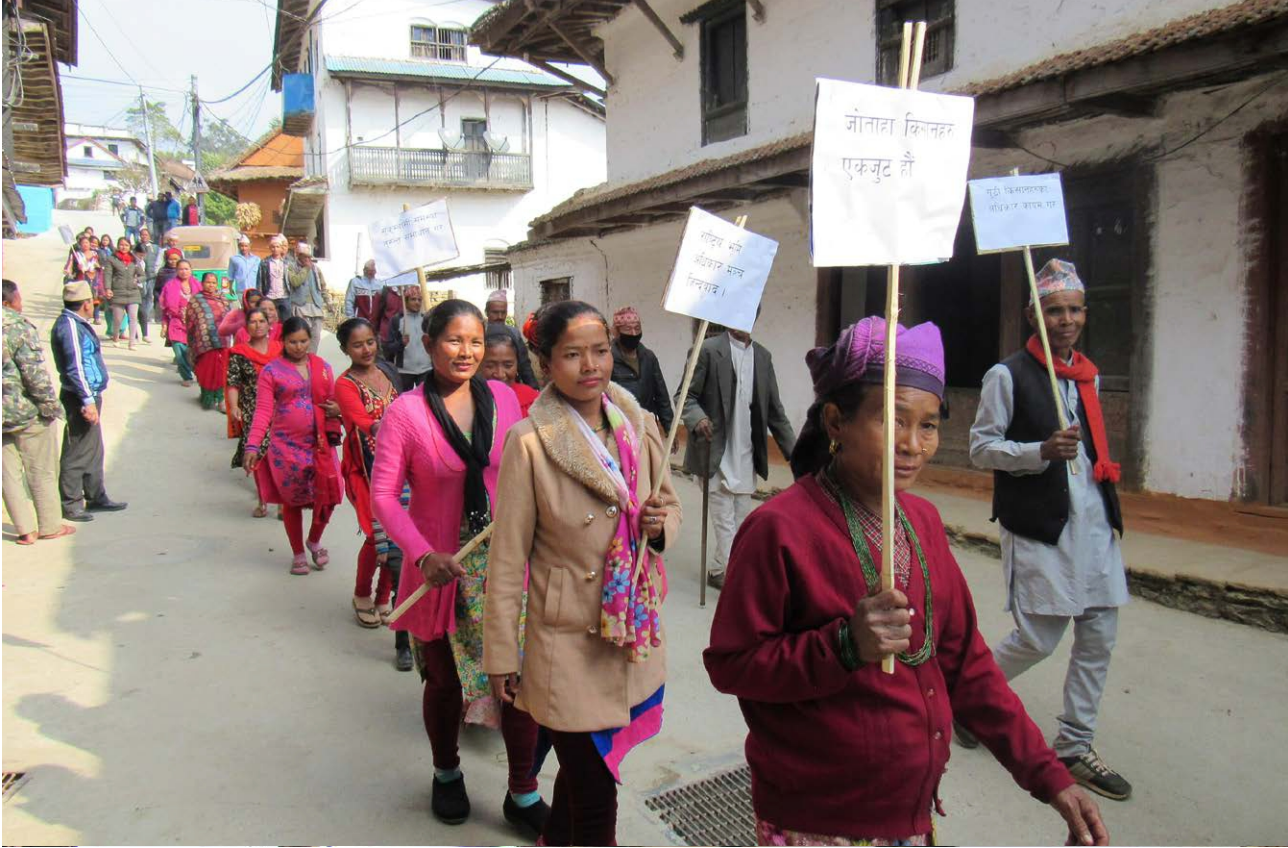
Women marching for their land rights.