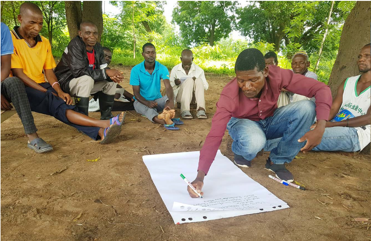
Communities in GVH Mangulu in Machinga District sharing and documenting their inputs into the NAP Process, with CISONCEC facilitation.

included and engaged in the development of the NAP. This will result in communities being more resilient and able to protect their lives and livelihoods in the face of disasters and climate change.