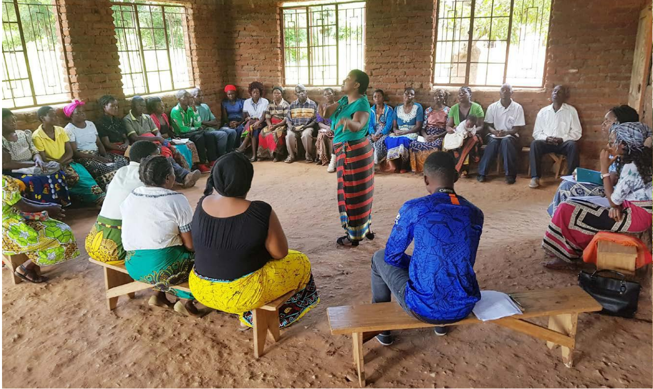
CISONECC facilitating NAP Sensitization meetings in GHV Gaga in Chikwawa District where communities, particularly women shared their inputs into the NAP Process.

The work ActionAid and its partners are doing aims to ensure that smallholder farmers, especially women farmers, can contribute to conserving, improving and making available plant genetic resources for food and agriculture, which constitutes the basis of farmers' rights. Together with other CSOs, farmer organizations, ActionAid and its partners are also ensuring the rights of women smallholder farmers to save, use, exchange and sell farm-saved seed and other propagating material, and to participate in decision making regarding, and in the fair and equitable sharing of benefits arising from, the use of plant genetic resources for food and agriculture are upheld.