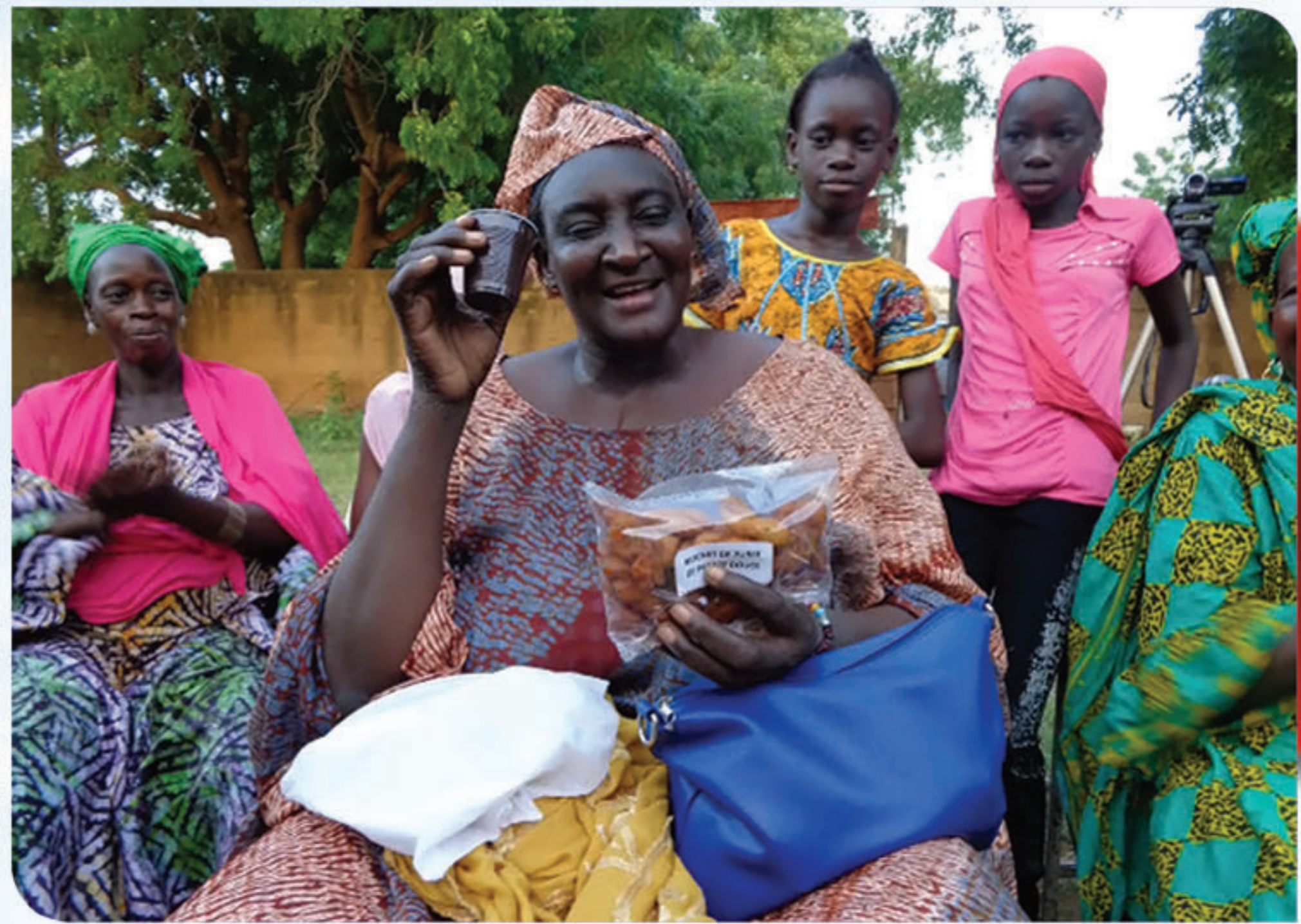
photo des femmes de l'association