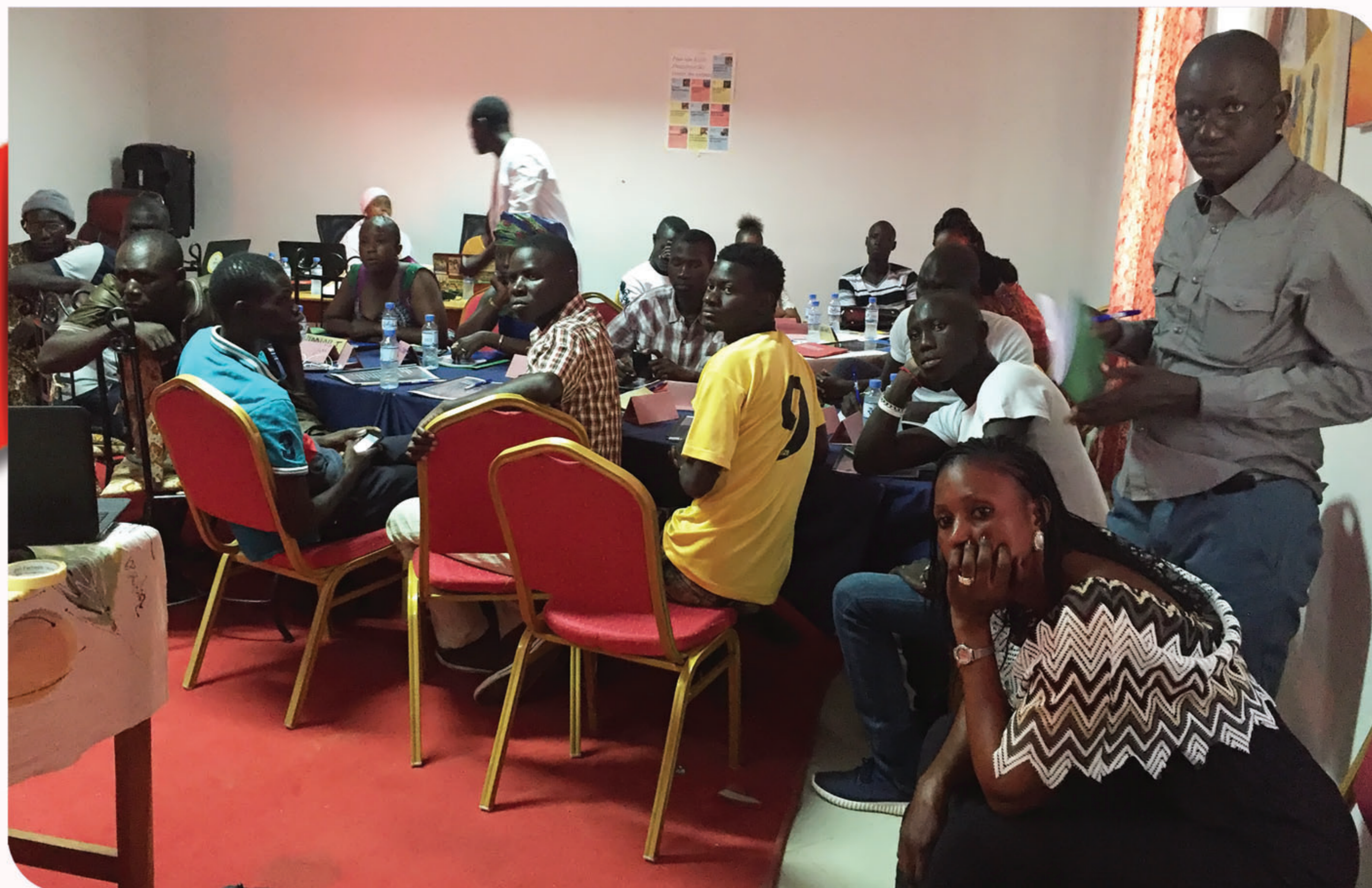
photo des femmes de Foundiougne en formation sur l'utilisation du Bio