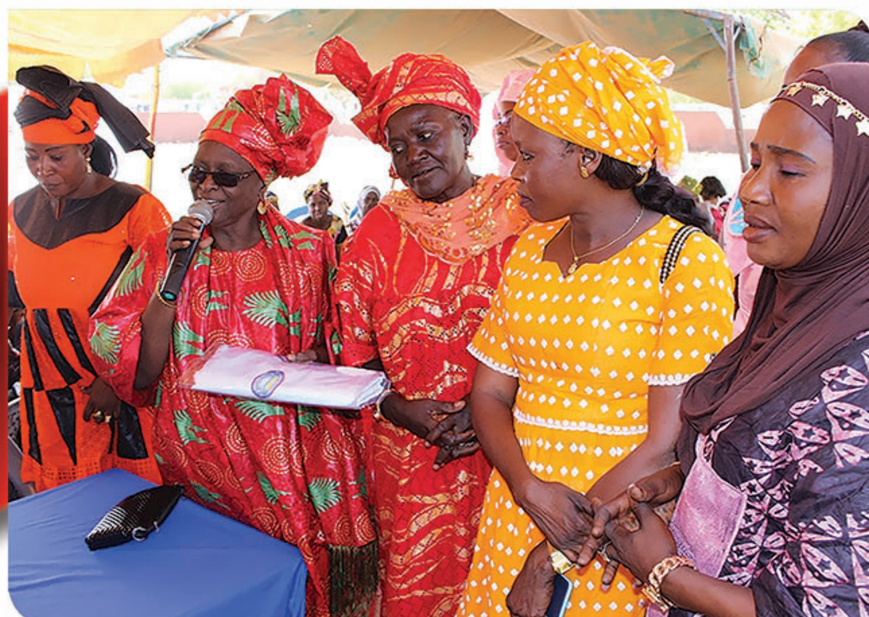
photo des femmes de Foundioune en formation sur l'utilisation du Bio