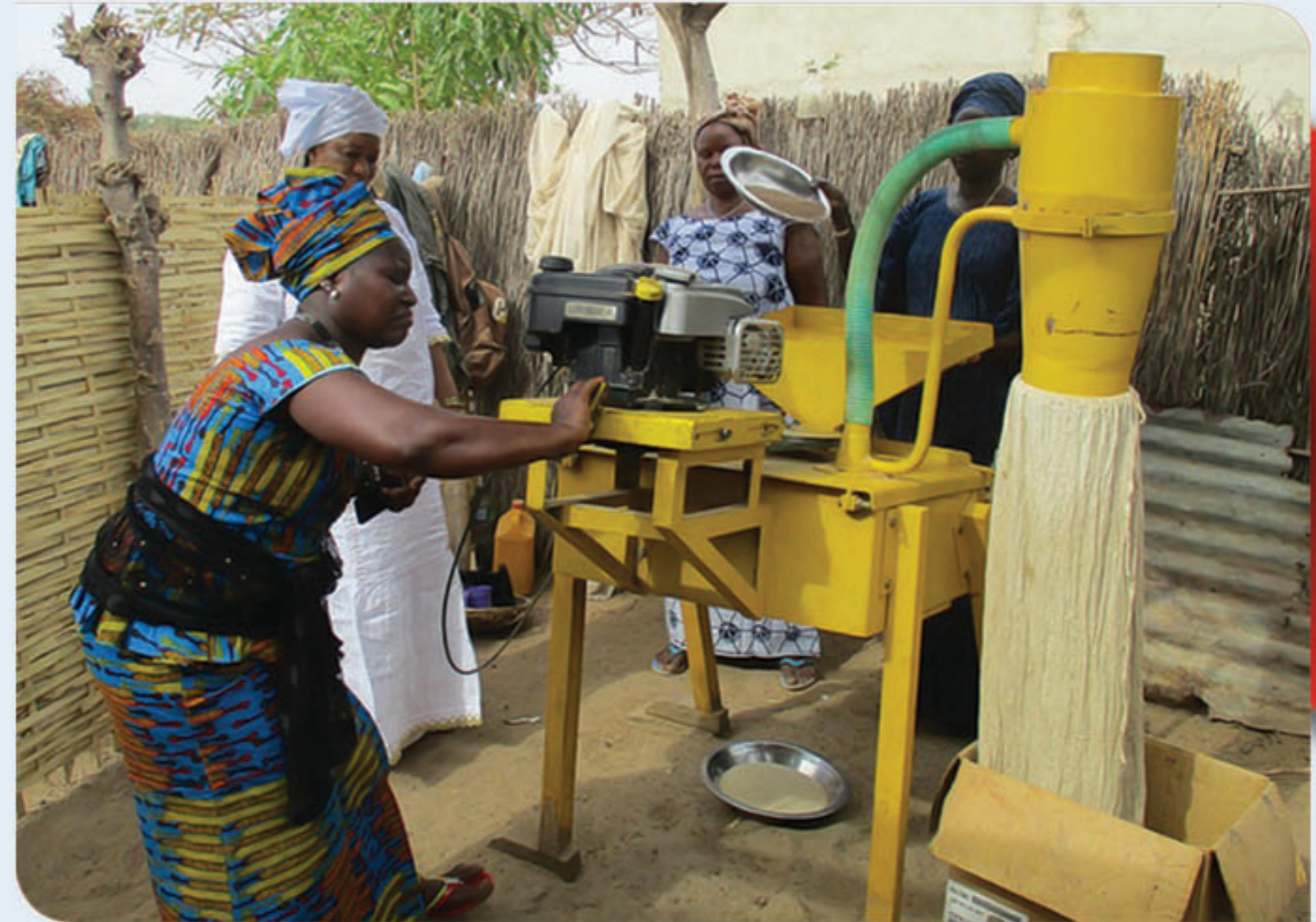
en tohmetat l'nu nohtemot oig ub nohtemot l'nu nohtemot en tohmetat l'nu nohtemot

In Foundiougne, Gender and Development clubs in the high schools are organizing trainings on violence against women and girls. There is not much security and control within the area and most members of the community are not sensitized on the issue of violence against women and girls. Girls often suffer violence in schools and women are afraid to denounce any case of violence or rape.