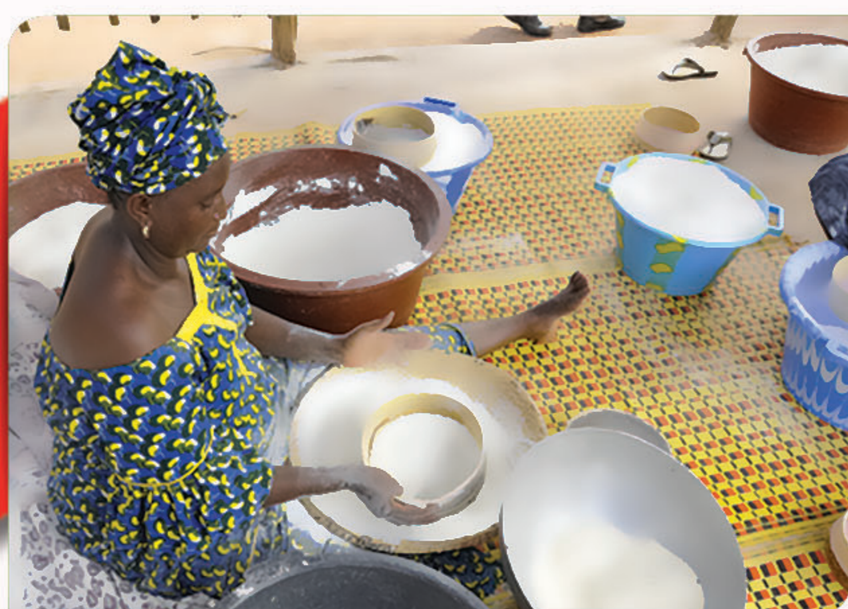
photo des femmes de Foundioune en formation sur l'utilisation du Bio