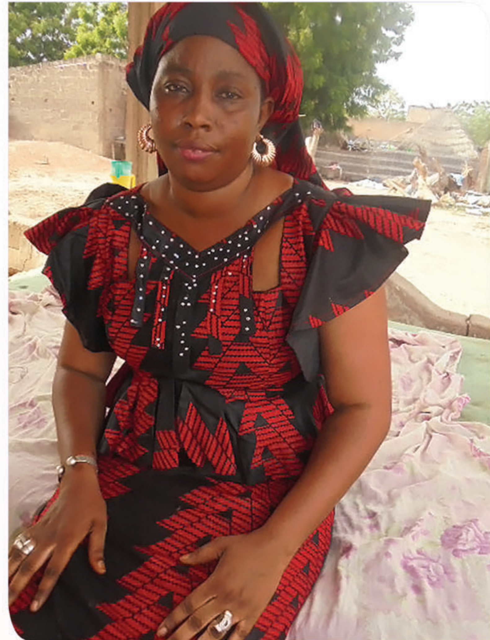
en formation sur l'utilisation de l'ordinateur photo des femmes de Koussanar

Now, women's rights and voices have been recognized in my community. I owe a big thanks to ActionAid and the federation for empowering us politically.” More than 22 women across the country in ActionAid Sénégal's nine LRPs are now actively involved in governance and holding political leadership positions.