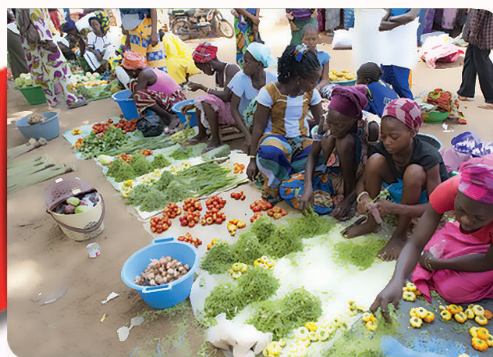
photo des femmes de Foundioune en formation sur l'utilisation du Bio