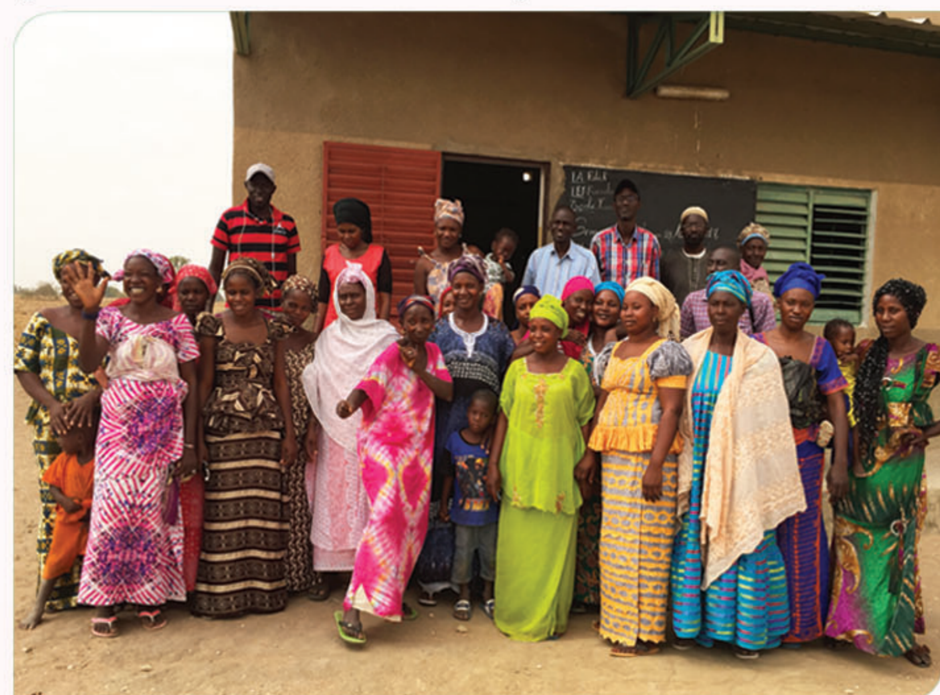
en formation sur l'utilisation de l'ordinateur photo des femmes de Koussanar