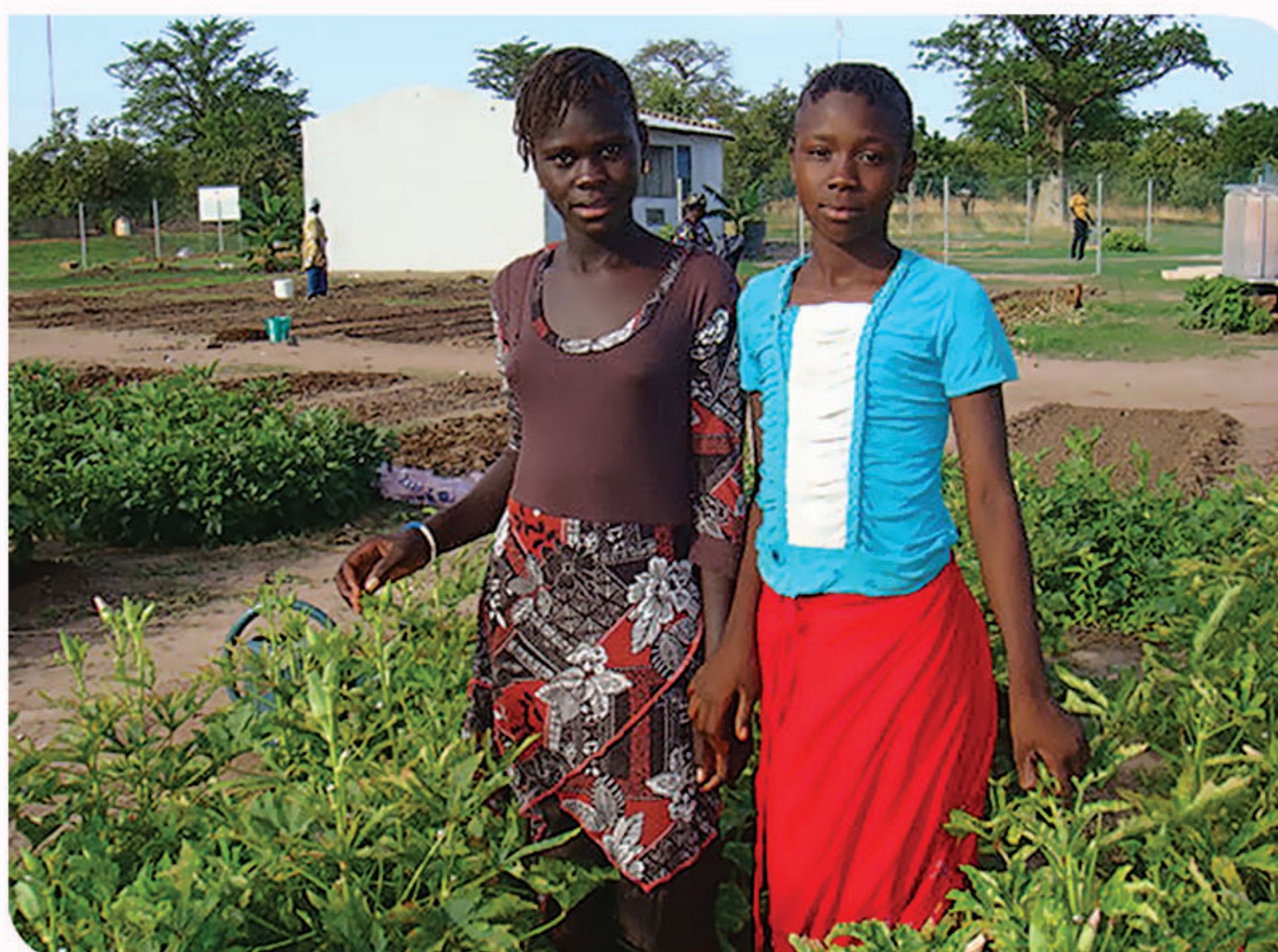
photo des femmes de Foundioune en formation sur l'utilisation du Bio