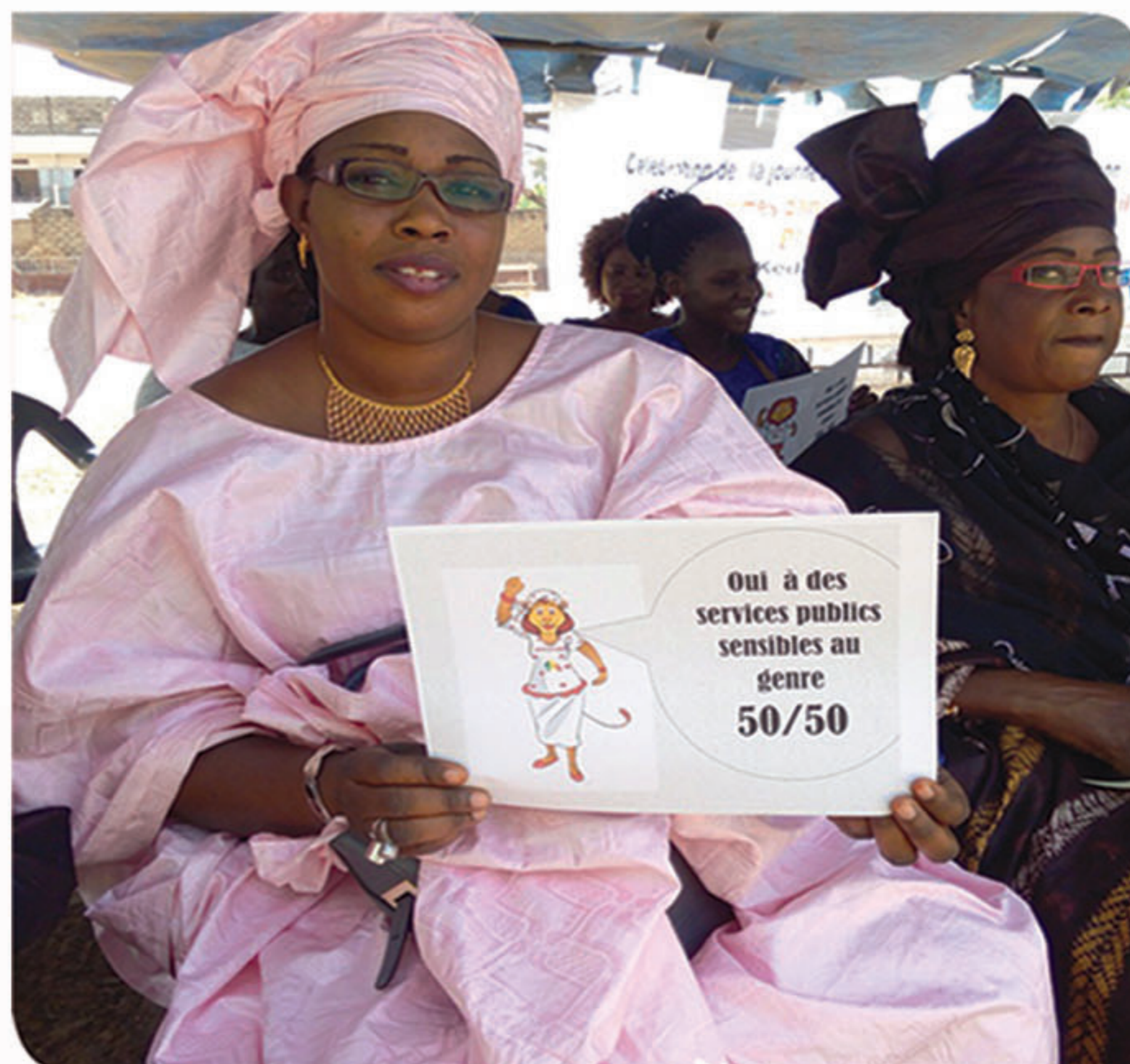
photo des femmes de Foundiougne en formation sur l'utilisation du Bio